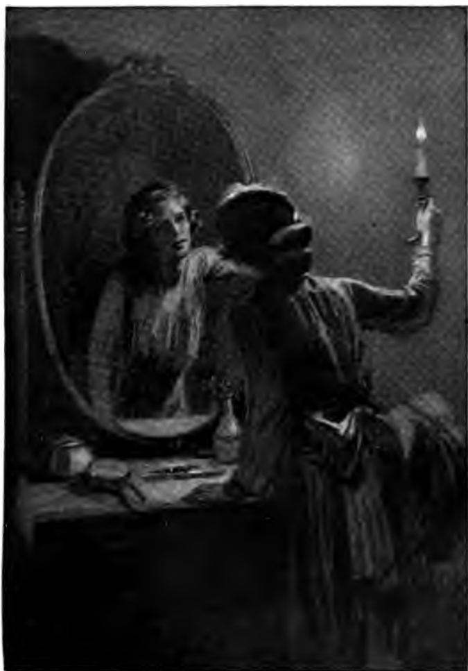
THE MIRROR SENT HER BACK A HAGGARD REFLECTION, PALE AND SOMBER